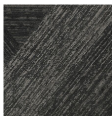
Onyx Silver 33505 LRV 4