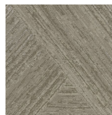
Element Platinum 33506 LRV 24.5