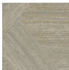
Alabaster Gold 33111 LRV 23.6