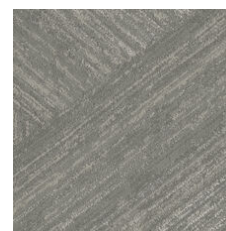
Forge Platinum 33518 LRV 15.9