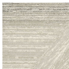
Carrara Silver 33100 LRV 49