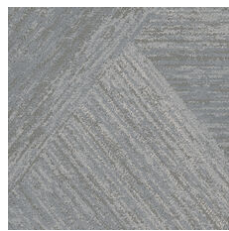
Talc Platinum 33535 LRV 22.7