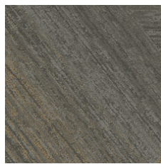
Cornerstone Cop 33555 LRV 9